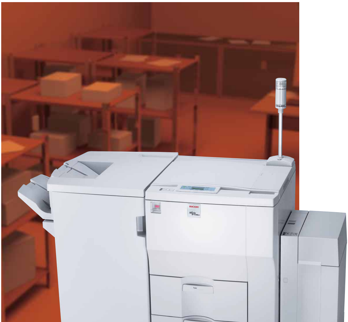
Aficio™ SP 9100DN