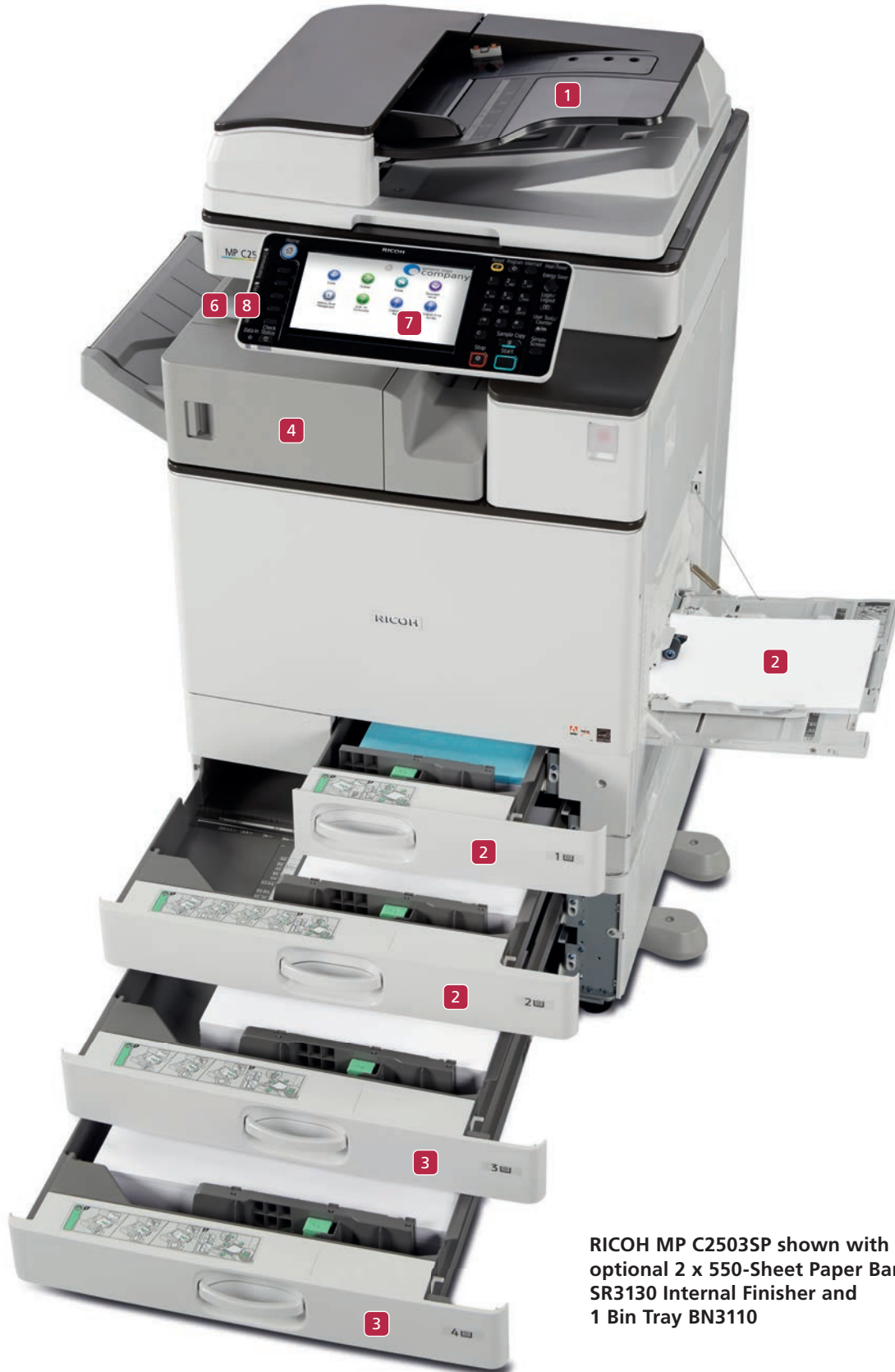
RICOH MP C2503SP shown with optional 2 x 550-Sheet Paper Bank, SR3130 Internal Finisher and 1 Bin Tray BN3110