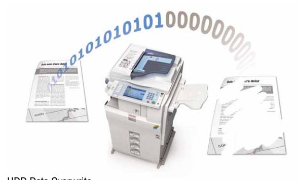
HDD Data Overwrite.

Authentication and encryption features protect your confidential data. The MP C2050/ MP C2550 are compatible with optional security packages like HDD Data Overwrite, Data Security for Copying, Card Authentication and Secure Print Release.