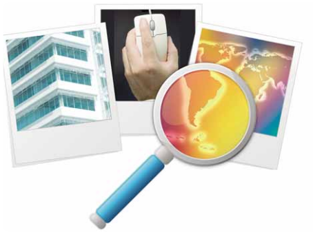
Crisp and accurate colour output.