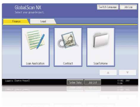
Easy-to-use Graphical User Interface.

Our intuitive GlobalScan NX streamlines your workflow with flexible scanning and distribution. Via an easy-to-use Graphical User Interface (GUI), preset icons with your customised document format and workflow. You can now scan in a single step from the MP C2050/MP C2550's control panel.