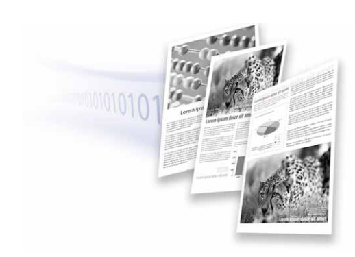
Only 2 seconds to transmit.

Creating reports, handouts or flyers? The MP C2050/ MP C2550 handle a truly wide variety of paper types. They accept sizes between A3 and A6, from light (52 g/m² via the bypass tray) to heavy (256 g/m² via standard and bypass trays). Glossy and coated papers or card stock are processed effortlessly. Even envelopes and transparencies can conveniently be fed via the standard bypass tray.