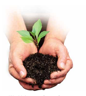
We think green. Do you?

'Green' is not just a colour for Ricoh — it is an attitude. Our PxP™ (polyester x polymerisation) toner is produced with significantly less carbon oxide emission than conventional toners. A more direct benefit for you is the MP C2050/MP C2550's standard duplex unit. Saving paper is kind to the environment as well as to the company budget.