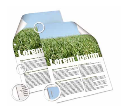
Staples and punches your output.

For the MP C2050/MP C2550, a unique internal 500-sheet finisher has been developed. It staples and punches your output. Add to your device's excellent print quality and media handling: you have the perfect office production partner. Limit document outsourcing, and produce a number of professional-looking documents in-house.